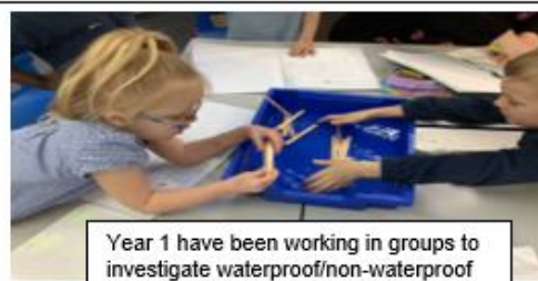
Year 1 have been working in groups to investigate waterproof/non-waterproof materials.

The school celebrated National Science week. Every year group did different investigations and experiments to test out different ideas. The children said they enjoy the practical side of science.