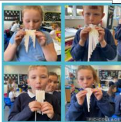
Year 4 investigated the patterns between the pitch of a sound and the size of an object.