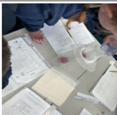
Year 5 have been investigating how to separate insoluble materials from liquids using filtering.