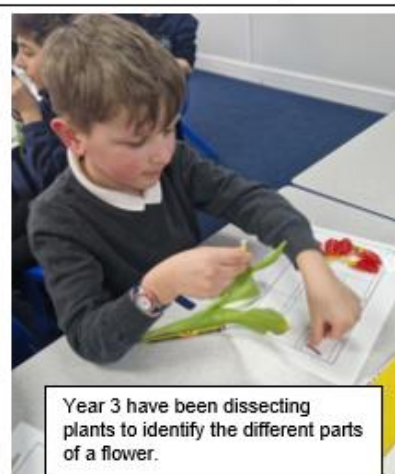
Year 3 have been dissecting plants to identify the different parts of a flower.